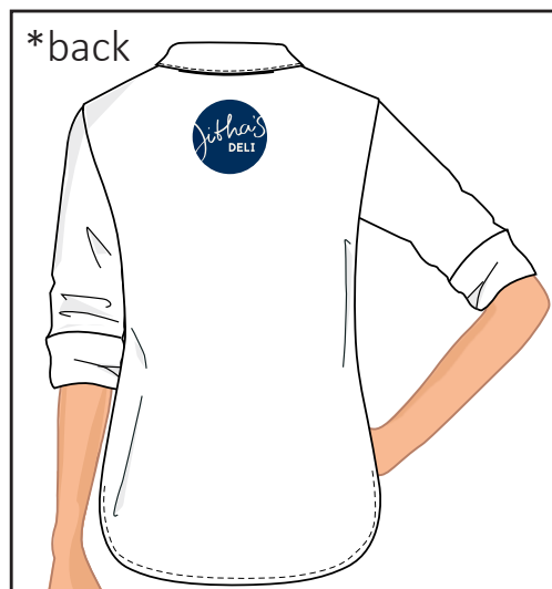
des.3.01 , blouse female woven 63/34/3% org cot/rec pol/stretch