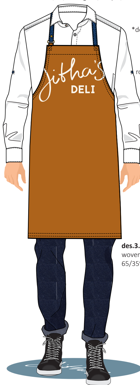
des.3.02 , heart apron woven 'olie-geel' 65/35% pol/cot stock