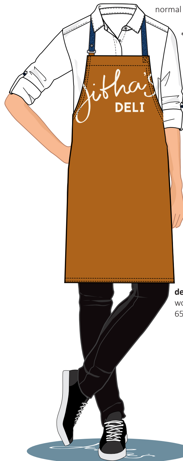
des.3.02 , heart apron woven 'olie-geel' 65/35% pol/cot stock