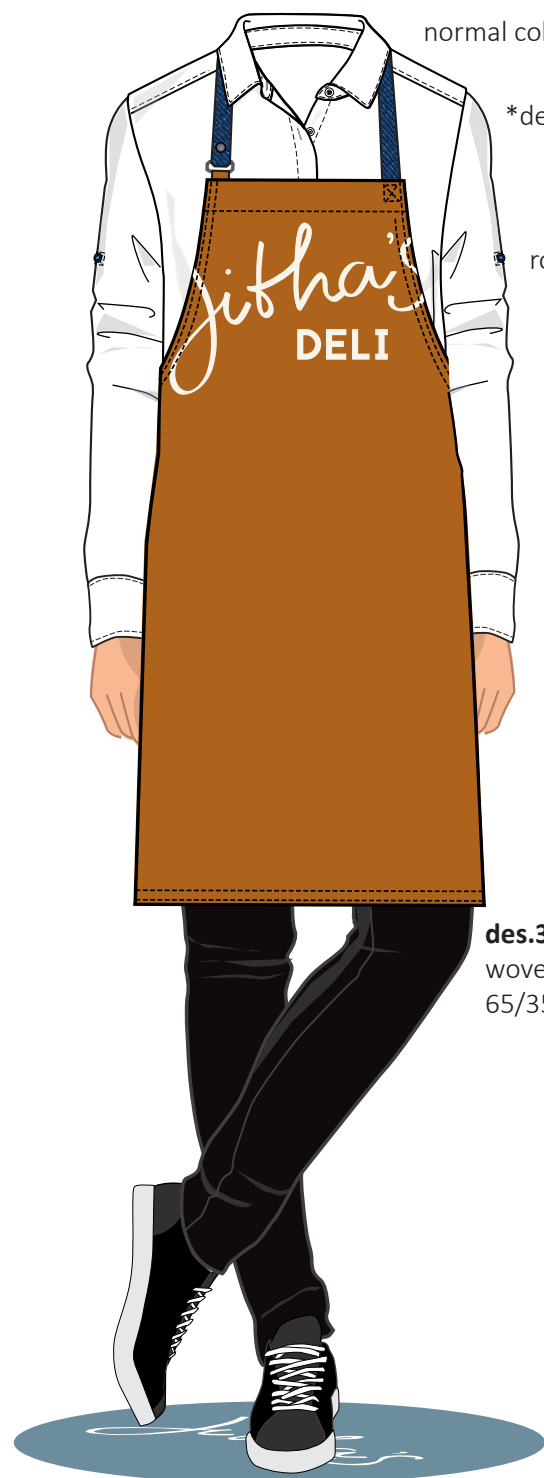
des.3.02 , heart apron woven 'olie-geel' 65/35% pol/cot stock