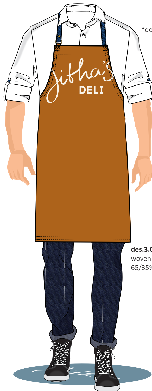
des.3.02 , heart apron woven 'olie-geel' 65/35% pol/cot stock